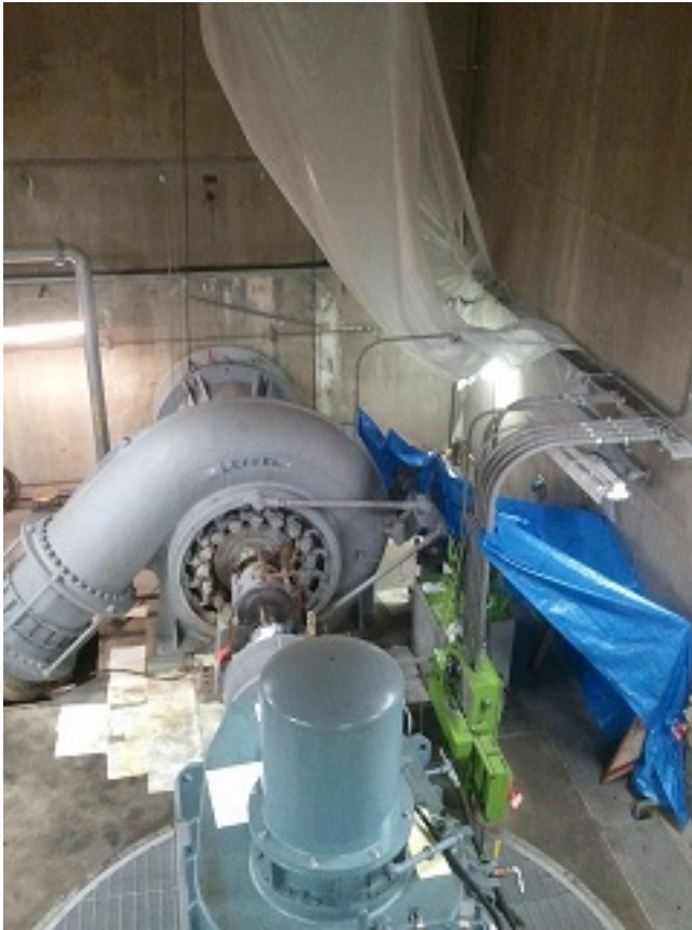
Image 1. Tarps covering equipment in SFL AWS turbine room.

All three JDS AWS Turbines are required in service to meet the full FPP criteria. The FPP provides operational guidance for AWS turbine failures. However, the two-turbine operations require ramping up the two remaining turbines to compensate for the lost hydraulic output and pulling floating orifices from unit gates 18 & 19. Returning turbine #1 to service will allow for full fishway operation at the FPP criteria. Inspecting the condition of turbine #2 guide bearing is critical to providing full operational criteria of the JDA-S fishway per the FPP.